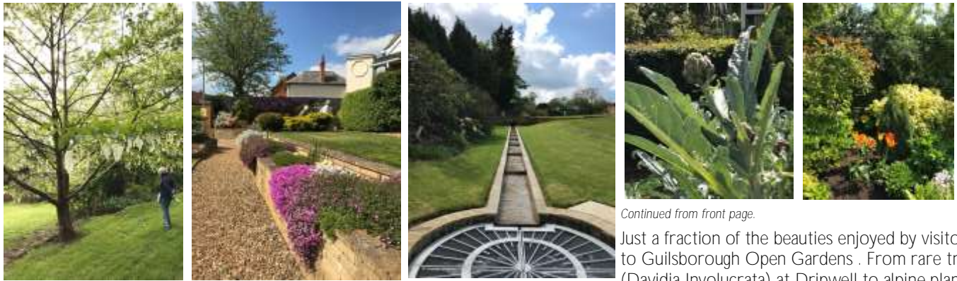
Continued from front page.

Just a fraction of the beauties enjoyed by visitors to Guilsborough Open Gardens. From rare trees (Davidia Involucrata) at Dripwell to alpine planting