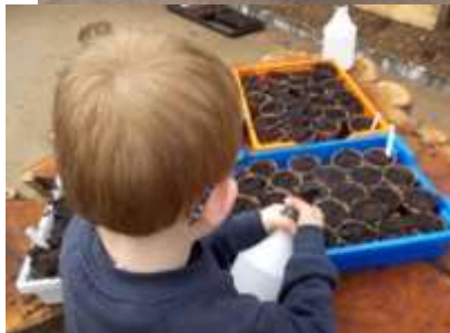
The lovely new outdoor table Being put to good use as the children use their green fingers.