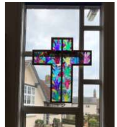
One of the new stained glass windows created by the school children.