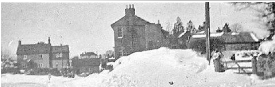
Guilsborough in 1947—no sign of Global Warming then! As we go to print in January winter has been mild but who know what Feb and March may bring.