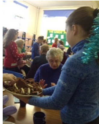
The year 6 community party