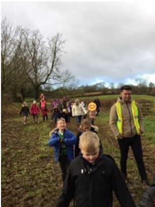
The children enjoying the seasonal village walk

Please remember to follow us on our website www.guilsboroughprimary.co.uk , or through our Twitter profile - @guilsboroughpri.