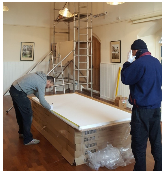
Installation of sound absorbing panels