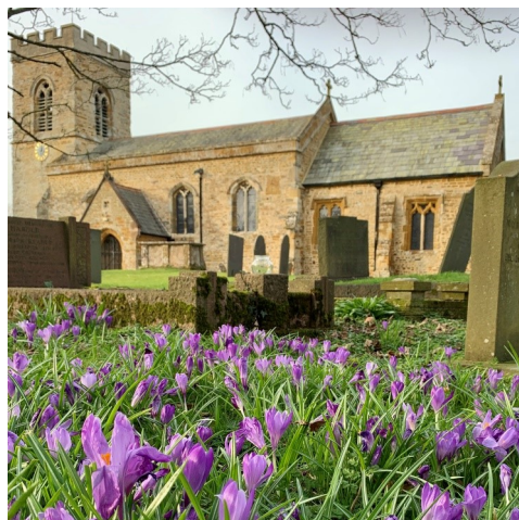
The Farm walk is in aid of St Mary's Church, seen here in its Spring splendour.