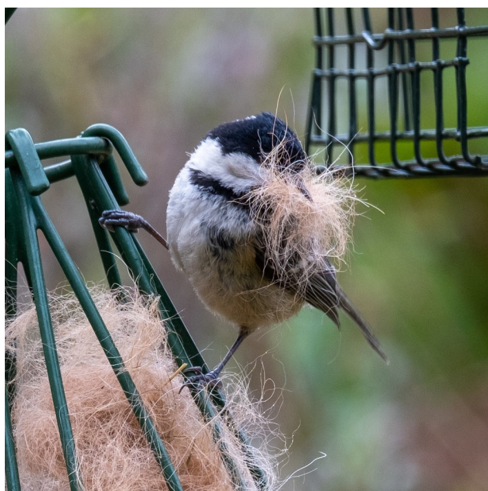
Spring can't be that far away, can it?

Poppies coffee shop is now open two days a week from 10am to 12noon on Wednesdays and Fridays only.