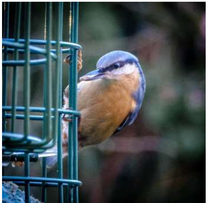
The Nuthatch can be a regular visitor to the bird feeders particularly in winter and early spring. They are more often seen moving quickly up and down trees looking for invertebrates in the bark.