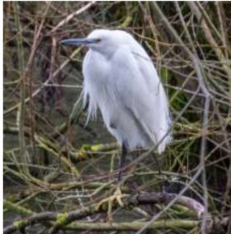
Egret at Pitsford Reservoir

Several changes evident in recent years would suggest that climate change is having a significant impact on bird populations. Some of these changes are obvious, while others are revealed by study of more detailed data, for example arrival and departure dates for migratory birds and nesting dates for breeding species.