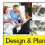
Design & Plan